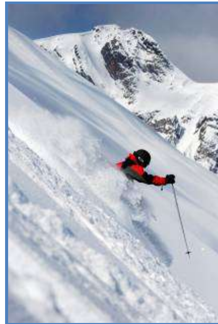
Early December Tree Skiing and April Glacier Skiing at Chatter Creek

You can also view some video of early December skiing on Chatter Creek's YouTube channel ( http://www.youtube.com/user/ChatterCreek ).